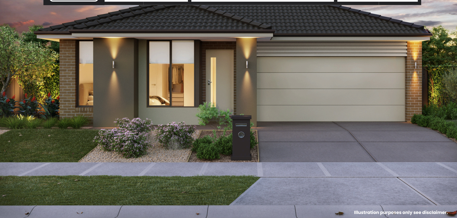
Illustration purposes only see disclaimer.